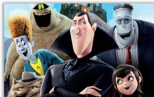
Hotel Transylvania 2