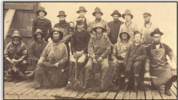
Cod-fisherman from New England